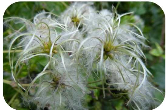
Old Man's Beard